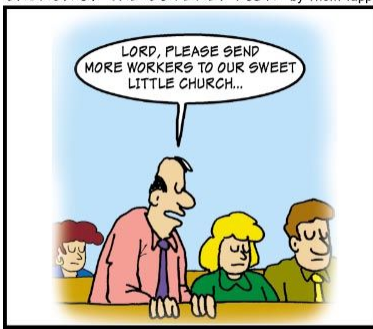
CHURCH OF THE COVERED DISH by Thom Tapp