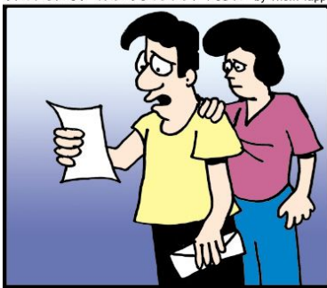
CHURCH OF THE COVERED DISH by Thom Tapp

"Its from our church... we've been called up for active duty."